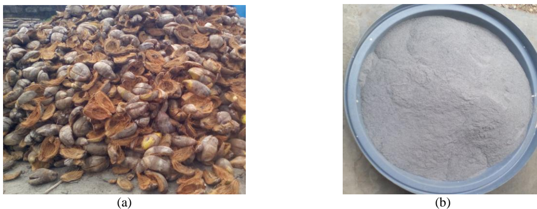
Figure 1 Material samples of: (a) Coconut husks; (b) Coconut husk ash

CHA was obtained by collecting and burning dried coconut husks. Coconut husks were collected from rural communities in Tarkaa and Konshisha Local Government Areas of Benue State, Nigeria, where they are dumped as wastes. The husks were dried to enhance combustion and then ashed in a furnace at a temperature of about 700°C for three hours. The ash remains were allowed to cool slowly, after which they were collected and stored in a moisture-proof polythene bag. Figure 1(a) shows a pile of coconut husks, while Figure 1(b) shows the ash remains of the burnt coconut husks.