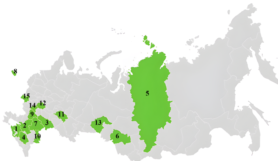
Figure 2 Geographical distribution of the top 15 biochar sales potential regions. The ranking numbers correspond to 1. Krasnodar Krai, 2. Rostov Oblast, 3. Saratov Oblast, 4. Stavropol Krai, 5. Krasnoyarsk Krai, 6. Novosibirsk Oblast, 7. Volgograd Oblast, 8. Kaliningrad Oblast, 9. Voronezh Oblast, 10. Astrakhan Oblast, 11. Republic of Tatarstan, 12. Ryazan Oblast, 13. Tyumen Oblast, 14. Lipetsk Oblast, 15. Bryansk Oblast.

the Kostroma Region ranks the lowest. An examination of the top 15 regions reveals that the greatest demand for biochar is concentrated in the federal districts of Southern (4 regions), Central (4 regions), Siberian (2 regions), and Volga (2 regions). Figure 2 illustrates the geographical distribution of the regions with the highest biochar sales potential. Each region is highlighted in green and labeled with its ranking number.