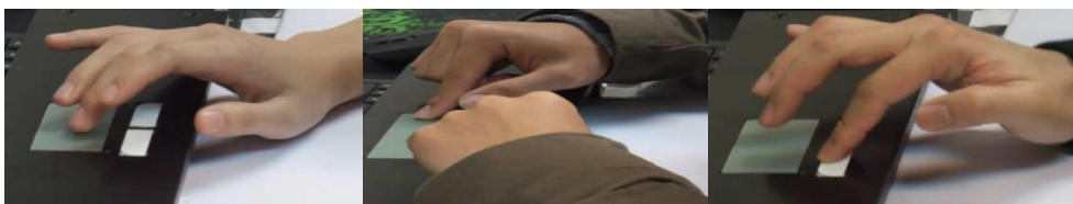
Figure 4 Behaviors of touchpad user

The different user behavior patterns significantly affected all of the dependent variables. By running ANOVA one-way, the type of hand movements used are being tested. The results are that the type of hand movement significantly affected movement time ( F=7.948 , p=0.005 ), movement count ( F=13.927 , p=0.000 ), error count ( F=8.038 , p=0.005 ), and re-entry count ( F=69.685 , p=0.000 ). Moreover, a one-handed user has higher movement time and re-entry count than a two-handed user. Otherwise, a one-handed user has a lower movement count and error count than a two-handed user.