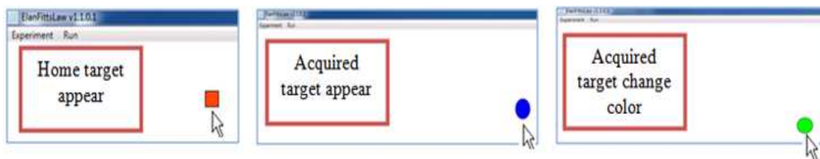
Figure 1 Illustration of the Fitts' Law Program

This experiment uses a 14-inch screen HP Notebook and two sizes of touchpads. The touchpad in this experiment was not a fixed touchpad, but the portable touchpad which could be connected to the notebook using a small wire. The Fitts' Law program applied in this experiment is a multi-directional tapping task. The home target was a square-shaped design and the target was a round-shaped design. The reason why this study applies a circular target is because a square target may pose a problem in that the target size is dependent on the angle of approach. The target size is not the same as when approaching a square target from a vertical or a horizontal angle or from a diagonal angle. If the target size is approached from a diagonal angle, the distance is perceptibly longer than from a horizontal angle, which will generate lower ID (Thompson et al., 2004; MacKenzie, 1995). The target was selected to appear in a random position in the screen. As shown in Figure 1, the color of target is changed if the cursor enters the target boundary. It follows the reality of a task in Windows, where the color of an icon or folder is changed when the cursor enters target boundary.