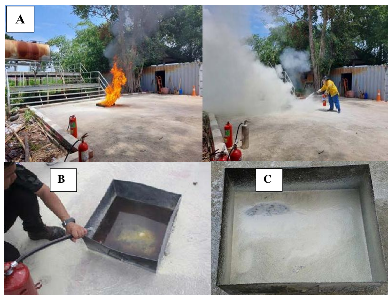
Figure 11 Fire tests of MAP and MAP+ Cellulose Hydrogel fire extinguishing agents(A), Fuel coating characteristics of MAP (B) and MAP+Cellulose-Hydrogel (C)