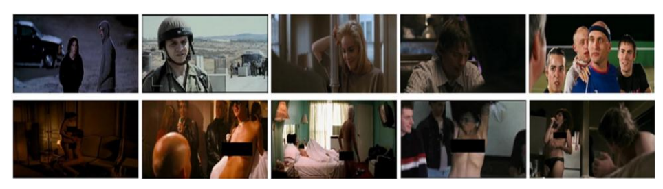
Figure 3 Presentation of sample pornography and normal content. The instances are taken from the video dataset. The top row presents negative samples, and the bottom row presents positive samples

Although the literature contains instances of audio datasets (e.g., for human activity recognition) (Piczak, 2015), there is still a lack of pornography acoustic dataset. In this research, we used a video dataset presented by Lopes et al. (2009), which included 179 samples of videos; sample video frames are depicted in Figure 3. Out of 179 clips, 169 soundtracks were extracted using a third-party software, while 10 clips were not included in the sound samples due to the corruption of the videos. Overall, the newly created pornography soundtracks included 89 instances representing positive samples and 80 instances representing negative samples.