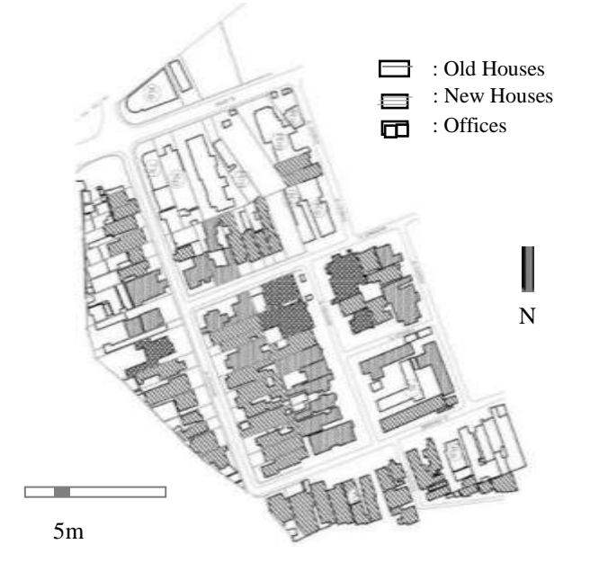
Figure 3 The mapping of formal settlement function

Cikini formal settlement has three types of houses. The first type is a multi-story house that serves as an office. The second type is a new house, and the third type is the old house. There are stark differences between these three types that can be seen in their facade condition. The first type usually advertises an office logo. The second type is in a minimalist style, with a tall fence a good distance away from the terrace. The old house does not have a fence and is surrounded by greenery.